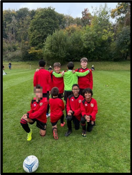
U11 Football team