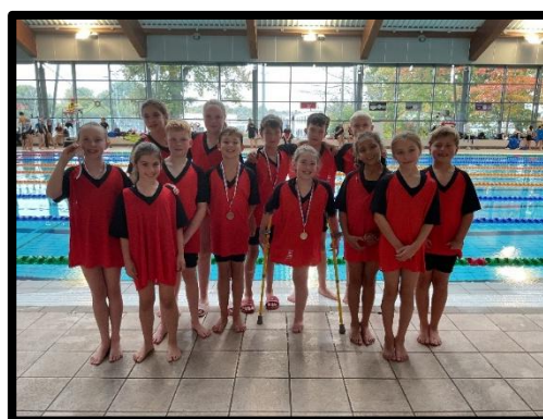
ISA Swimming Gala team