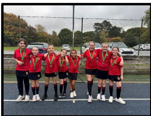
U11 Netball team – Gold medallists!